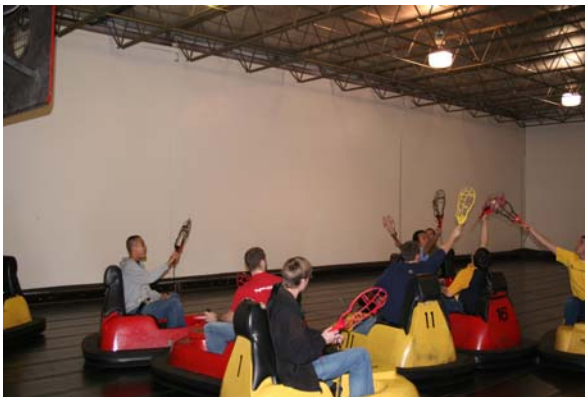
Whirly Ball on a Friday night