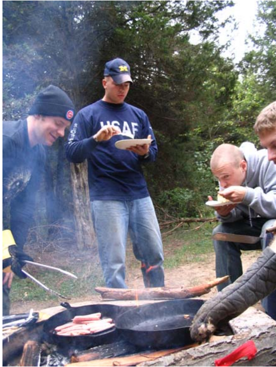
Cooking pancakes and bacon over the fire on the house camping trip

We had a great time camping in Pinckney in September. We survived on hot dogs and s'mores but only after we tracked down some firewood that was "dead and down."