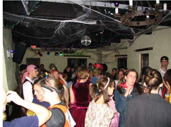
Lots of people at the Fall Costume Party