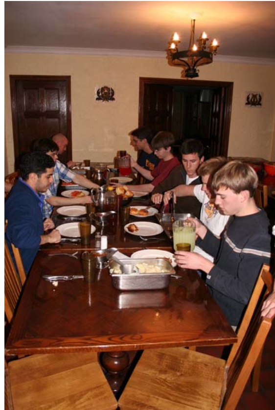
Dinner with the new dining room tables

The kitchen has seen a few changes this year. The old refrigerator finally died, and we had to purchase a new one. Also, we were given beautiful new dining room tables by a generous alumnus.